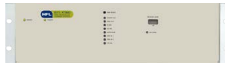
9780/9785 Power Line Carrier Systems