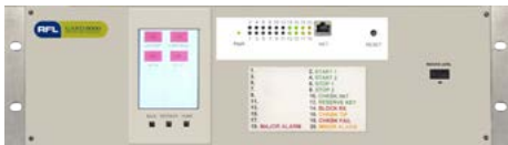
GARD 8000 Global Architecture Relaying Device

RFL's protection solutions are well into their fourth-generation, providing highly-reliable power system protection. Many of RFL's protection products are backed by a 10-year warranty, along with product and field support, and commissioning assistance. RFL® protection platforms provide the highest level of security and dependability, to help deliver power safely, reliably and cost effectively.