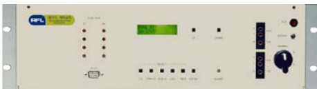
9745 Analog/Digital Teleprotection Device