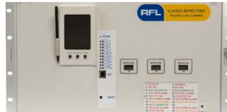
New GARD 8790 Pro Global Architecture Relaying Device with New GUI Interface